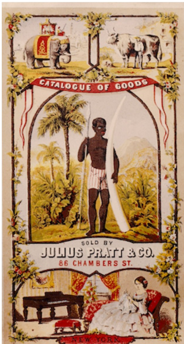
Figure 4. Cover for Julius Pratt & Co. catalogue, ca. 1865.

Thus, although they may not have known it, or cared even if they had, ivory consumers, dealers, and manufacturers in the late nineteenth century were complicit in the brutal enslavement and decimation of African people (Figure 5).