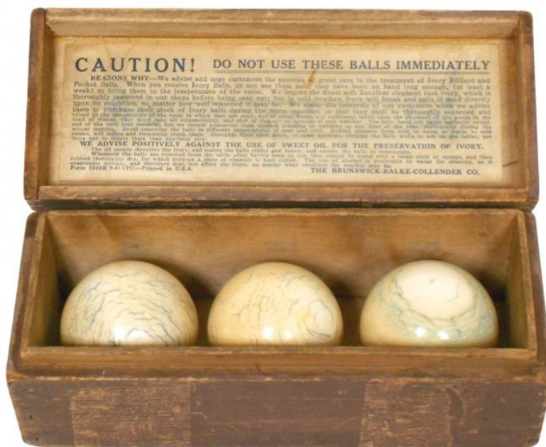
Figure 2. Ivory billiard balls manufactured by the Brunswick-Balke-Collender Company. The set sold for $800 in May 2013 by Rich Penn Auctions, Waterloo, Iowa.

Americans were as bloody minded as other people in their exploitation of animal resources. They sent the passenger pigeon and Carolina parakeet to extinction and greatly endangered wolves, grizzly bears, and the bison (not to mention American Indians). By the end of the 1800s, big game hunting on African safaris had become an acceptable, even somewhat romantic endeavor epitomized by the character Allan Quatermain in the popular 1885 novel, King Solomon's Mines , by H. Rider Haggard. U.S. President Theodore Roosevelt was an archetypical ‘great white hunter’. After leaving office, he organized the 1909-1910 Smithsonian-Roosevelt African Expedition where he and his son Kermit killed over 500 animals including eleven elephants (see Figure 3) (Meredith, 2001). This enterprise had scientific overtones rather than commercial objectives. The animal skins were eventually mounted and displayed at the National Museum of Natural History in Washington and the American Museum of Natural History in New York, with duplicates distributed to other museums across the U.S. to build their collections of animal specimens.