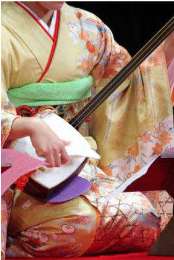
Figure 7. Musician playing shamisen with ivory bachi.

After China and Hong Kong, the United States may have had the world's next largest retail ivory market according to a census of items seen for sale conducted in 2006 and 2007 at 657 outlets in 16 cities (Martin & Stiles, 2008). Out of 24,101 items counted, about 7400 appeared to have been crafted after the 1989 ban on importation and were presumably illicit. The authors estimated that the U.S. consumes less than one ton of raw ivory annually, down from seven to eight tons a year in the late 1980s. This may indicate falling consumer demand, but the decrease may also result from smugglers successfully evading law enforcement.