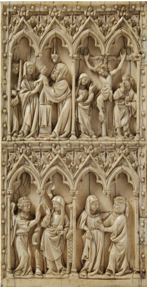
Figure 1. Ivory diptych (14x7.9cm) carved with scenes from the life of Christ, probably France ca. 1350-1375.

In addition to its uses in the West, ivory sourced from both African and Indian elephants lent itself to the intricate geometrical patterns and Arabic inscriptions found in Islamic Art. India and Sri Lanka also have had long traditions of ivory