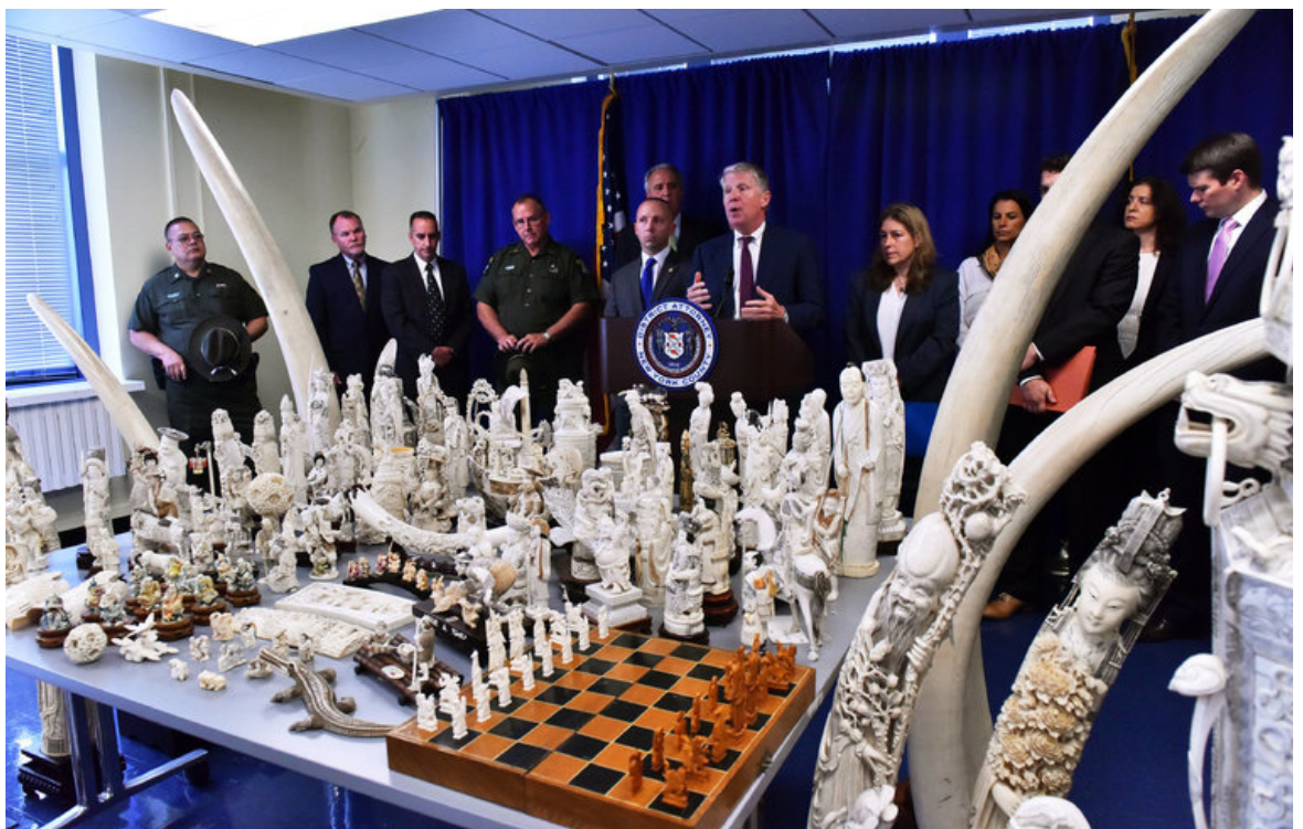
Figure 9. Ivory confiscated in New York City in 2017.