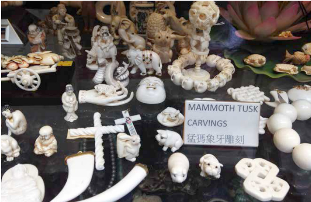
Figure 6. Small items in Hong Kong, 2014.

Ivory consumption in China has features in common with the growth in demand for shark fin soup. Once a traditional delicacy only a few Chinese could afford, rising affluence has enabled more Chinese to partake with the expected consequence being rapidly declining shark populations. Fabinyi (2012) discusses the cultural and social context of this demand. Traditional Chinese medicine links seafood to bu foods, which purportedly imbue strength and health and promote virility. Wild foods have more bu than domesticated foods and studies have shown that Chinese men more than women prefer to consume wildlife (Wasser & Jiao, 2010; Zhang, Hua & Sun, 2008). Ancient Confucian notions of man subjugating nature shape modern Chinese attitudes toward wildlife. In addition, shark fin soup is featured in important social functions, such as weddings and banquets, where the cultivation of guanxi (connections) and social display are important (Fabinyi, 2012). Chinese probably do not spend money on ivory trinkets and figurines for sexual potency, but like shark fins these objects made from wild animals can become a vehicle for conspicuous consumption. Many of the ivory statuettes depicted in the photos accompanying Martin and Vigne's (2015) monograph are carvings of dragons, Laughing Buddhas, and other traditional characters from Chinese folklore, further reinforcing cultural meaning.