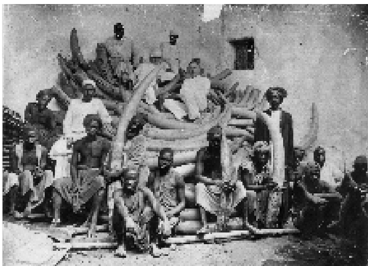
Figure 5. (Top) African slaves in chains, ca.1890s. (Middle) Ivory caravan fording stream near border of Belgian Congo, ca. 1908. (Bottom) Zanzibar natives and two American buyers sitting on approximately 50 recently harvested ivory tusks, ca. 1890-1910.