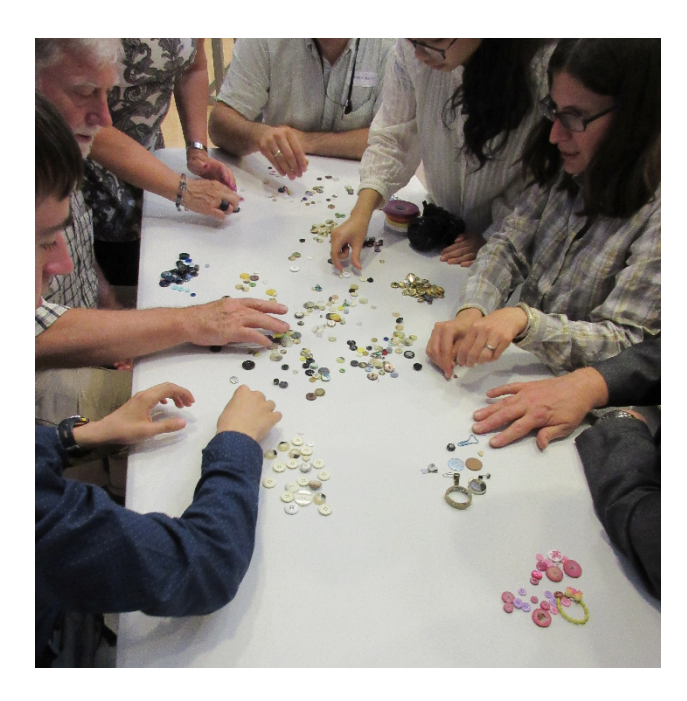
Figure 1 – Cultural Animation activity, mapping the food environment with buttons

For the second CA activity, the groups were asked to use ordinary items (boundary objects) that the theatre practitioners had placed in the centre of the room to create a picture depicting the food future that they would like to see for the local area. Each member of the group selected an item and presented it to the remaining group members explaining what it represented to them. As an example, one individual selected an umbrella, explaining that it is important to have protection when you 'don't know what's coming'; another selected a camera, which could be used to collect stories of the ways in which people worked together. Someone else selected a net, which they displayed fully stretched out across the wooden frames. They explained that 'throwing out the net' was a central part of their future vision, catching and helping those in need but also allowing connections and bonds to be made.